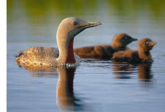
Red-throated Diver • Gavia stellata