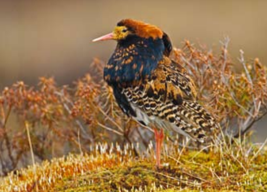
Ruff • Philomachus pugnax