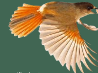
Siberian Jay • Perisoreus infaustus