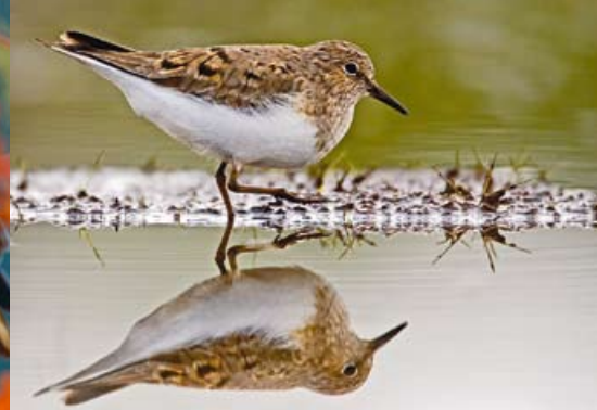
Temminck's Stint • Calidris temminckii