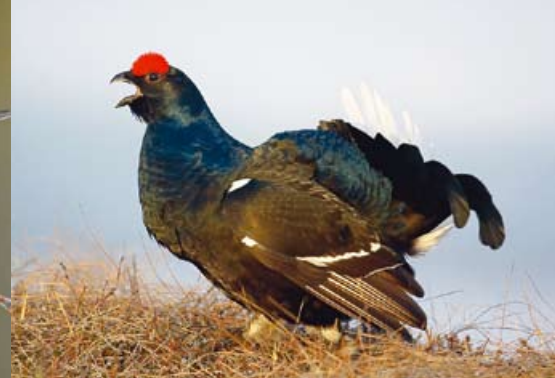
Black Grouse • Tetrao tetrix