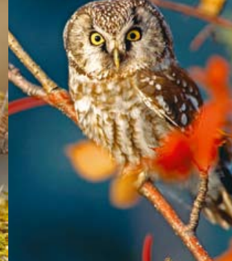
Tengmalm's Owl • Aegolius funereus