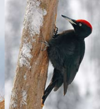
Black Woodpecker • Dryocopus martius