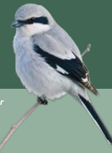
Great Grey Shrike • Lanius excubitor

For further information on bird-watching in Lapland and about species observations, please visit the Ornithological Society of Lapland's website: www.lly.fi .