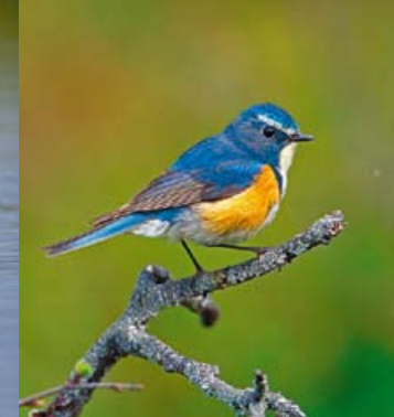
Red-flanked Blue-tail • Tarsiger cyanurus

Wagtail and Greenish Warbler. Services available: Lean-to, campfire place, and latrine equipped to be accessible by handicapped persons. A nature trail 3.5 km in length leaves from köngäs with a lean-to and campfire place halfway. The trail goes along the bank of Auttjoki and passes by Könkäänvaara where there is a tower. It takes a couple of hours to walk the trail. Village shop, bar, and petrol station at Vanttauskoski. Coordinates: Auttiköngäs parking area 7355131:3509202, Auttiköngäs 7355125:359276, and Könkäänvaara tower 7354822:3508816.