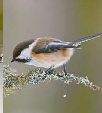
Siberian tit • Parus cinctus