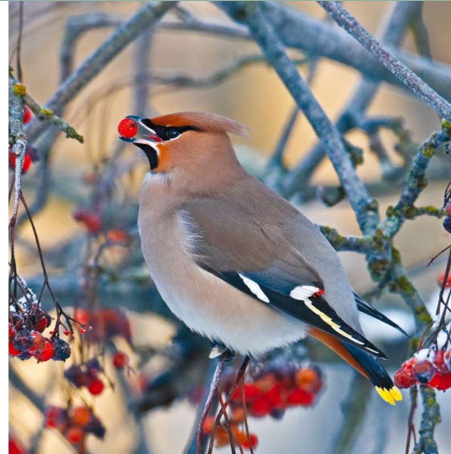
Bohemian Waxwing • Bombycilla garrulus